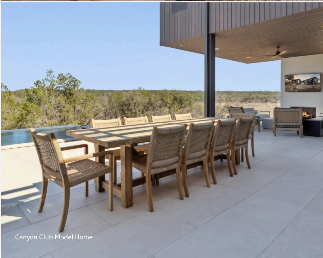
Canyon Club Model Home