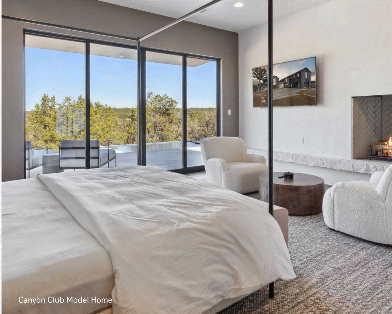
Canyon Club Model Home